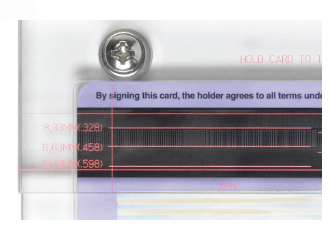
Portion of developed card with Q-View magnetic developer